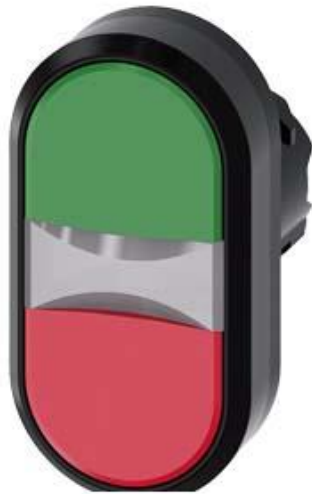
TWIN PUSHBUTTON, 22MM, ROUND, PLASTIC, GREEN, RED, FLAT BUTTONS